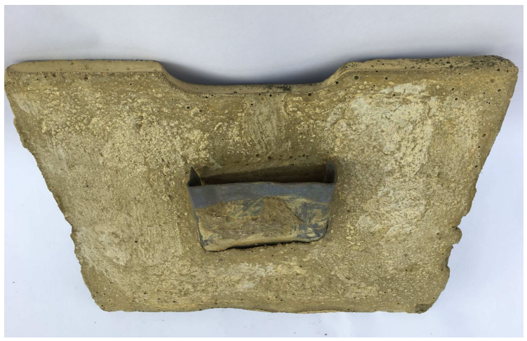
Vent viewed from behind