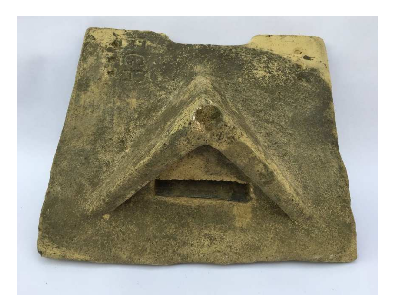
Vent viewed from the front

They have an approximately 20mm x 100mm slot cut in the front of them, with a lead sheet fitted into it and extending up the sides. The lead sheet extends behind the tile so it can be bent upwards gently to make sure it is weatherproof on shallow pitched roofs. If this is done, it is important to check that the gap between the lead and the back of the tile is at least 20mm throughout.